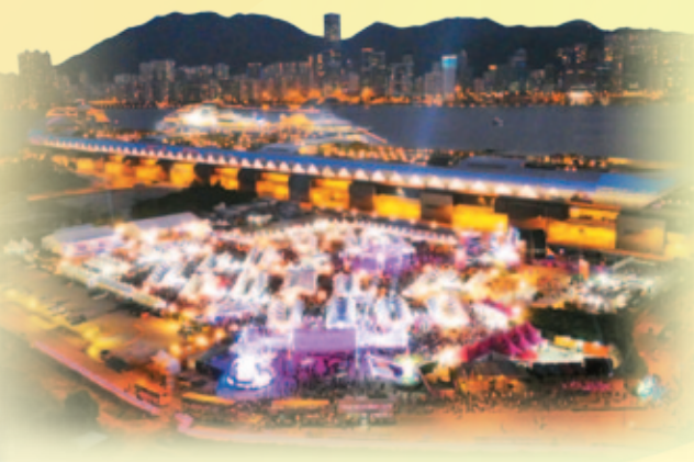
香港旅遊發展局舉辦的 2014美酒佳餚巡禮 Wine and Dine Festival 2014 staged by the Hong Kong Tourism Boar